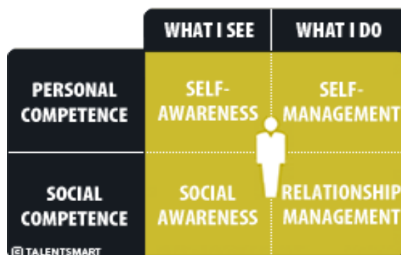
Fig 4 Induction of change in context with Change Management with Emotional Intelligence.

Emotional intelligence is made up of four core skills.