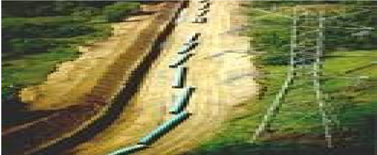
Figure 3.2 showing new pipe line construction site

Sarir project have team to design a new site through professional service of creating and developing concepts and specifications that optimize the function, value and appearance of products and systems for the mutual benefit of both user and manufacturer. In designing the location, Sarir determine suitable plant location for interrupted operation and maintaining pipelines and safety fig 3.2. Factors influence the effectiveness of the plantlocation are near to oil field, employee, material handling, strategic objectives, and socio economic factors. The effective plant location factors will achieve various objectives like efficient utilization of available land space, minimizes cost, allows flexibility of operation, provides for employees convenience, improves productivity etc. The entrepreneurs must possess the expertise to lay down a proper layout for new or existing plants. It differs from one plant to another. But basic principles to be followed are more or less same. Although, this report is mainly conducted with Sirir Gas turbine in main but it is applicable to all types of industries or plants.