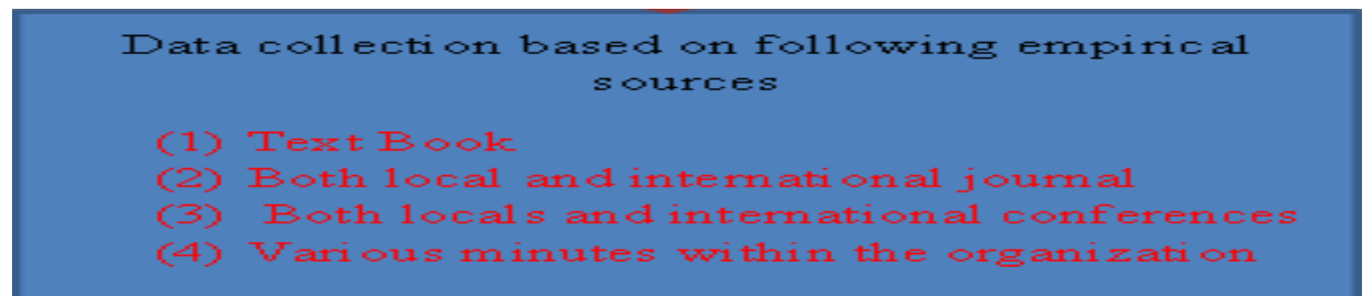
Figure 1 outline of research methodology

The outline of research methodology for this report is presented in the form of a chart given in figure 1. The highly competitive environment, linked to the globalization phenomena, demands from companies more agility, better performance and the constant search for cost reduction. The present study focused on the analysis of plant location effectiveness on the study of Sarir Gas Turbine 855 MW Project Site at General Electric Company of Libya. The Materials are among many factors that contribute to improve a company's performance. The report is related in this work was performed in Sarir Gas Turbine 855 MW Project Site at General Electric Company of Libya. It was founded in the recent years and is classified as large-sized companies that provide electricity to Libya. The Sarir region contains a cluster of industries of metal-mechanic, automotive and metallurgical sectors that in its majority belong to production chains which demand a high internal performance level from their partners so the gas turbine is one them.