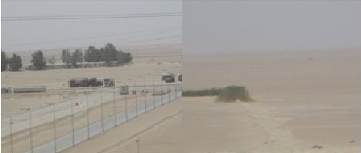
Figure 3.5 Showing the desert area of the company

This type of problem ranges from a simple facility location problem where the only decision made is where to establish a new plant, to more complex problems that decide on several aspects at the same time figure 3.5, such as inventory, demand allocation, reliability, routes and others. The company transportation factors have been considered as inputs to several types of models serving as a multiplying weight; however, these factors have not been considered as decisions. Some of the factors related to the complex concept of transportation are: availability and reliability of diverse transportation modes and infrastructure; existing capacity in links, nodes and transportation modes; reduction of transit times for each transportation mode; maximization of transportation resources utilization; improvement of routing and scheduling performance; climate; community culture; regulations and quality standards; and others, along with the more traditional factors of distance, demand, and cost. The regular monthly fuel consumption is high and to keep this smooth is very difficult and this is provided in the summary.