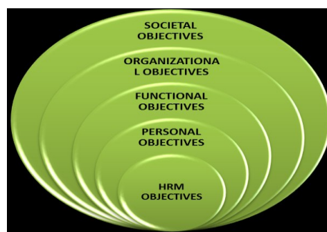
Figure1. The Objectives of Human Resource Management