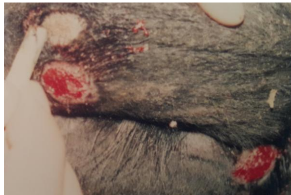
Figure 2: Application of silver nitrate pencil on scraped lesion.