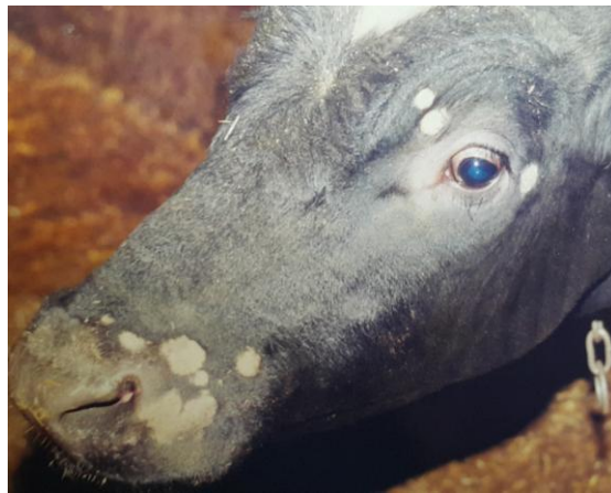
Figure 1: Circular, circumscribed, grayish-white hairless areas at muzzle and around eye.

Chemically synthesized veterinary medical preparations or antibiotics no used for prevention of disease at organic livestock (25). So silver nitrate pencil can be used in ringworm treatment at organic livestock.