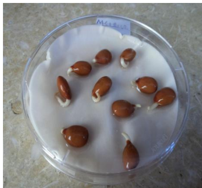
Figure 3. Mechanical scarification & soaking in sulphuric acid treatment.