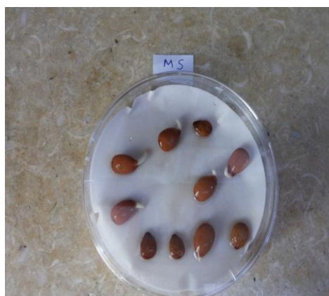
Figure 6. Mechanical scarification treatment.