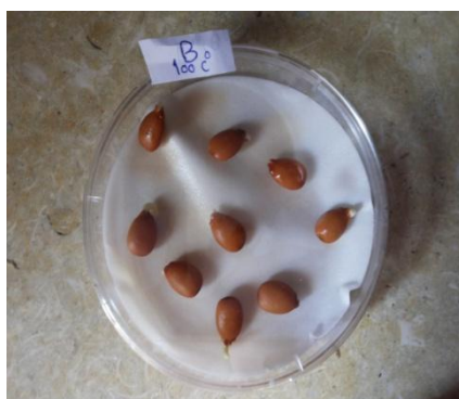
Figure 4. Boiling water (100°C) treatment.