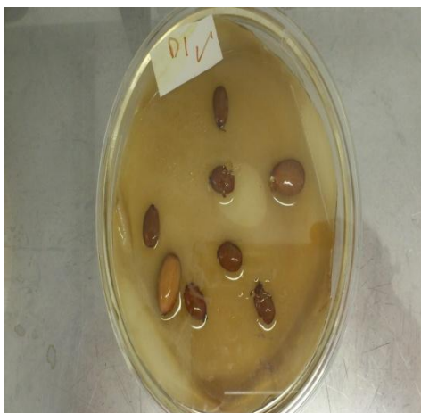
Figure 7. Soaking in distilled water treatment.