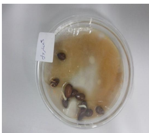
Figure 8. Control (untreated seeds).