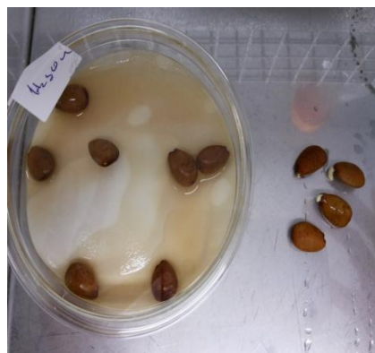
Figure 5. Acid scarification with sulphuric acid ( H_2SO_4 ) treatment.