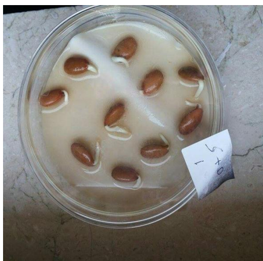
Figure 2. Mechanical scarification & soaking in distilled water treatment.