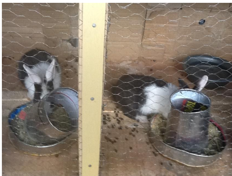
Fig. 2. Chinchilla rabbits feeding on Senna obtusifolia formulated diet.

Countries should consider Senna obtusifolia as fodder (shade dry in to hay/silage) crop and not wild weed and, adoption of rabbits as indirect biological method of controlling notorious Senna obtusifolia weed against herbicides, the dangerous chemical method of controlling Senna obtusifolia .