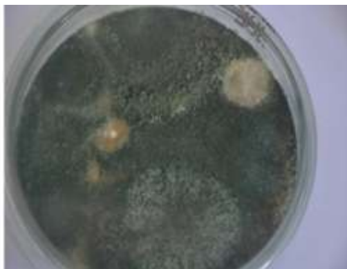
Fig 2. Antagonism test between Rhizoctonia solani pathogens and Trichoderma isolates collected from tidal swamp lands.

Trichoderma has ability to produce toxic substrate which is able to countermeasure other fungi or microbes in growth media. The substrate of Trichoderma has antagonism traits to plant pathogens, and has saprobes traits. A study confirms that pyrone which are produced by Trichoderma harzianum contributes to the antagonistic ability of this fungus. Trichoderma harzianum was widely uses as biological control in order to increase crops productivity [19] [20] [21].