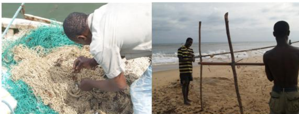
Plate 2: Fishermen removing Sargassum hystrix var fluitans from fishing nets in Lagos and Ondo coastal communities.

Fishing gear used by artisanal fishermen and industrial trawl net were observed to have being clogged by the floating mass of seaweed. Different fishing gears used in the area that were impacted included gillnets, beach seine, stownet and trawlnets. As a result of clogging by seaweed cleaning of fishing nets and preparations for fishing trips took longer hours as demonstrated in (Plates 2 and 3).