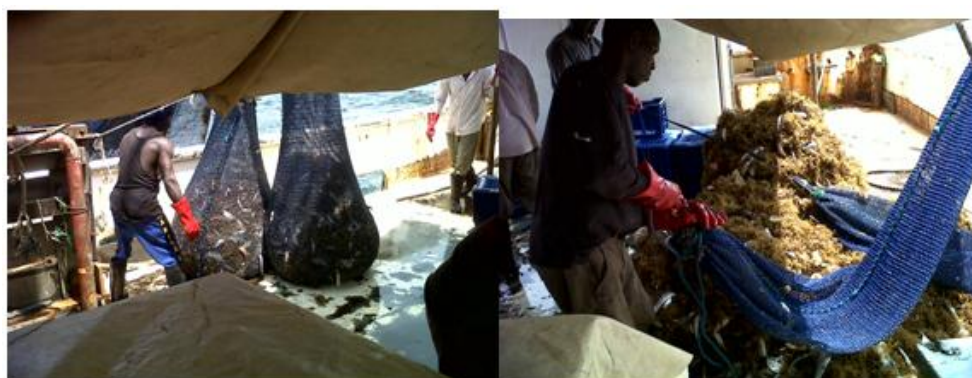
Plate 3: Industrial trawl net filled by Sargassum hystrix var fluitans .