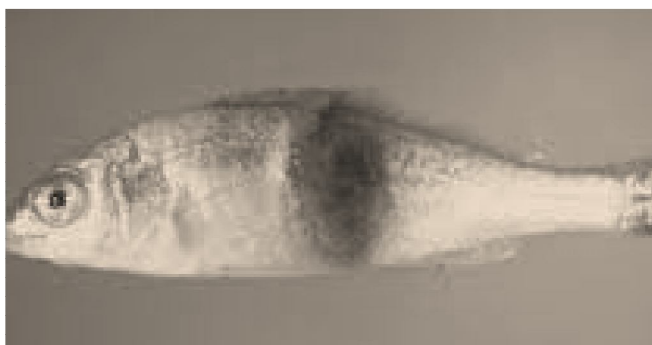
Fig. 2-EUS (Epizootic Ulcerative Syndrome) disease in fish

It must to be mentioned that reports of fish mortalities occurring in the water bodies of India are infrequent. Fisheries management practices are not working properly in the region. However, with the outbreak of epizootic ulcerative syndrome (a disease caused by the fungus, Aphanomyces invadans , red spots develop on the skin which later on becomes ulcers and then followed by the development of granulomas on the internal organs which becomes the cause of mortality in fishes) a system of disease surveillance and monitoring was initiated in a structured manner, and reports have been obtained.