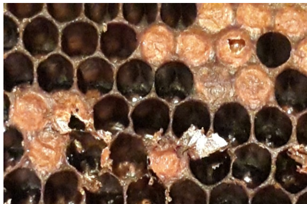
Fig.1. Bee comb contains irregular pattern of brood with perforated and sunken caps.