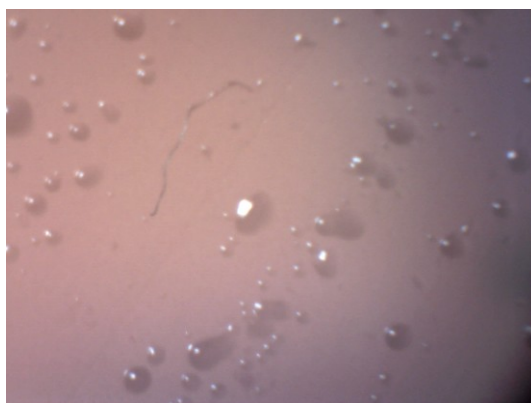
Fig.2. Isolated colonies of bacteria were variable in size, round, dark brown in color.

Colonies varied in size some were large while other were small about 1-2 mm in diameters, round with entire edge and smooth glistening with dark brown in color as shown in Fig. 2.