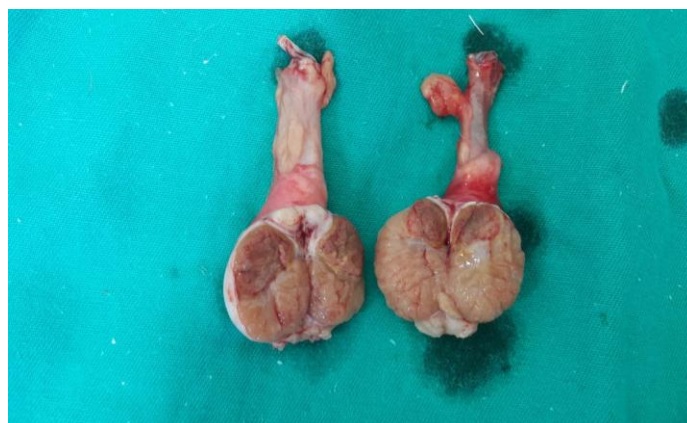
Figure 2: Appearance of necrotic area in adult dogs (dark areas).