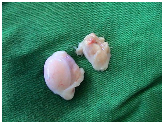
Figure 1: Severe atrophy and normally testes in non-adult dogs.

necrotized regions were differentiated ultrasonographically from the normal testicular tissue with hypoechoic appearance. The testicles underwent atrophy at the 30 th day in 3 non-adult dogs but marked alteration was not observed in adult dogs (Figure 1). In a non-adult cases, testicular swelling was associated with fistula and sloughing of the scrotal skin. At necropsy, their testicular tissues were found to have totally been necrotized and obtained a muddy texture. These problems were not recognized in any other cases. In adult cases macroscopically restricted necrotized region showing dark area (Figure 2). In dogs younger than 6 months old, gross appearance of the testes received 20% hypertonic saline solution became completely necrotic with demarcation line at the end of 2 days. At the end of 60 days; testicles were hard in consistency and smaller in appearance. Histopathological examinations indicated that focal coagulation necrosis in testicular tissue together with diffuse and severe degenerative changes in seminiferous tubuli (Figure 3). There was sparse Leydig cell in tubular lumen.