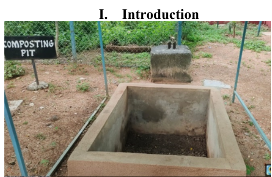
Figure 1 COMPOSTING PIT

Composting is a self-heating biological process [bioengineered,2022] in which breaking down of organic materials such as food scraps, yard waste and other biodegradable items into nutrient rich substance takes place to form a compost. This process occurs naturally through the action of microorganisms such as bacteria and fungi which decompose the organic matter over time. The product obtained through composting is used as soil fertilizer, apart from improving the soil quality it also helps in managing the waste produced through many activities, ultimately called as waste management. As, microbial action is very important in the whole composting process, according to various research conclusions there are certain conditions which Favour the growth of microbes, duration of composting process and quality of compost formed