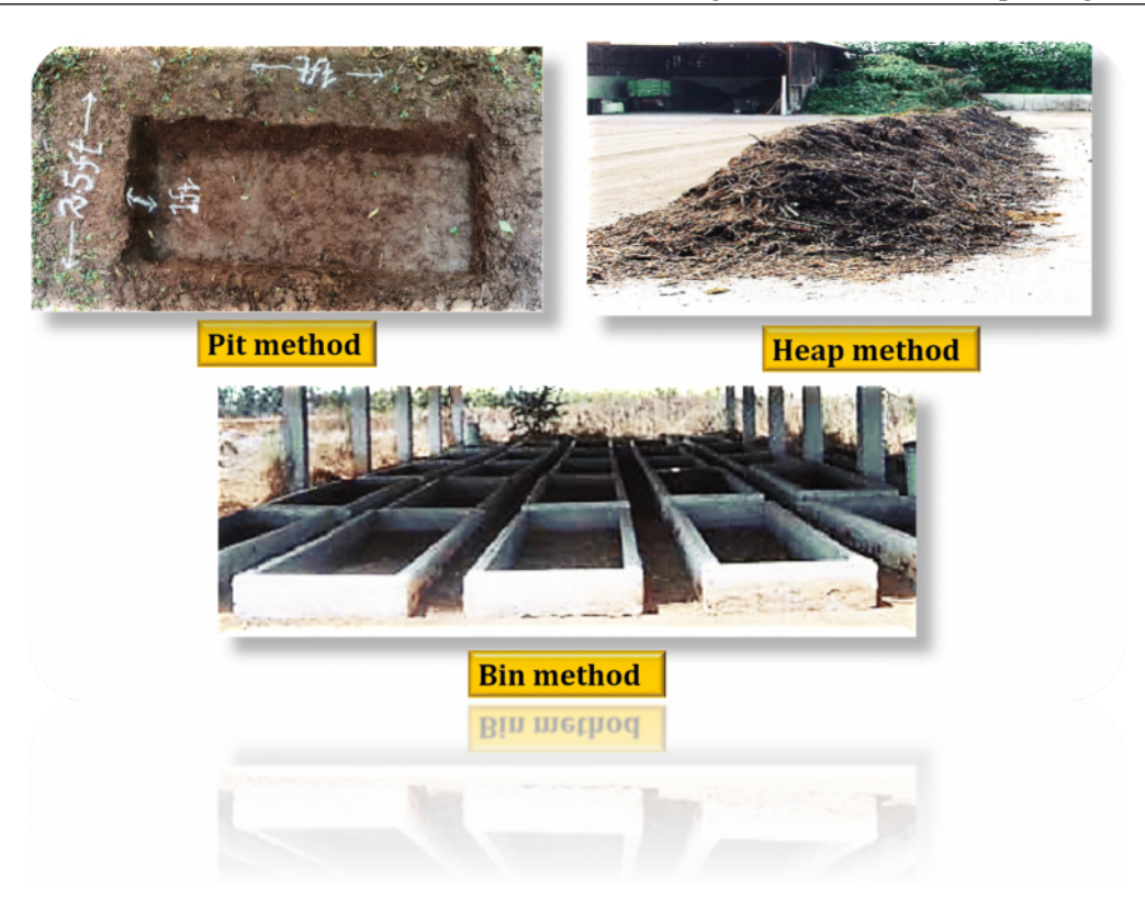
Figure 3 METHODS OF VERMIOMPOSTING