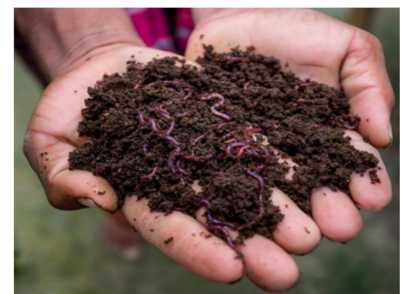
Figure 2 COMPOST ALONG WITH EARTHWORMS

Vermicomposting is a reforming process by which organic waste is broken down through the synergistic actions of earthworms and microbial communities. Vermicomposting has been shown to credibly reduce organic biomass and generate high-quality fertilizer for plants. Vermicomposting is a nutrient-rich organic enhancement generated from organic waste through the combined action of earthworms and microorganisms. The contributions of earthworms towards vermicomposting can be grouped into two phases: (i) an active phase characterized by the ingestion and processing of the organic wastes by earthworms and, (ii) a maturation-like phase in which microbes degrade the earthworm-processed materials.