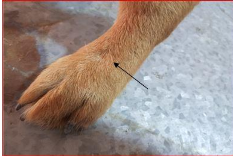
Fig 3: Edema of hind legs is obvious with pits on pressure

The vital signs of the diseased dog show, body temperature (39.4C), the heart rate were 132/ min, respiratory rate of 40/ mint. Table 2. Besides, examination of blood parameters indicates mild anemia. Table 3. Moreover, Biochemical changes reveal Hypoproteinemia, Hyponatremia, and Hyperkalemia in disease dogs Table 3.