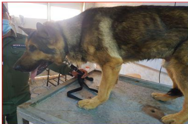
Fig 1: The animal feel discomfort