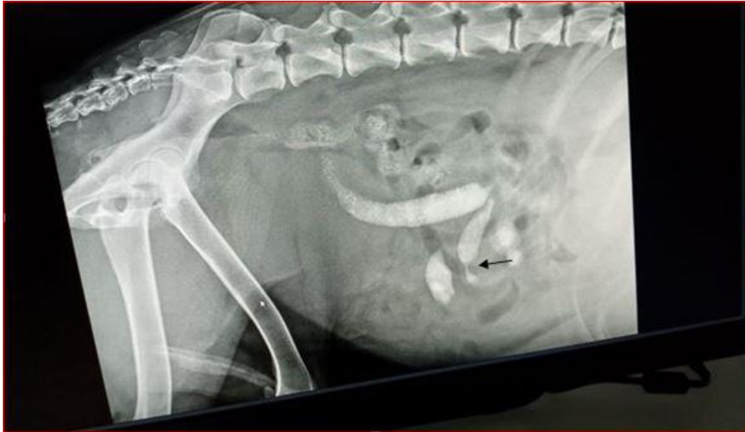
Fig 4: Abdominal radiograph(A latero-medial view) of the dog for which intestinal stenosis of a part of the large intestine was noticed ( arrow)