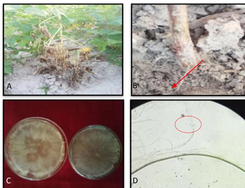
Figure 1. Symptoms of stem rot disease in soybean plants (a): symptoms in the field, (b): S. rolfsii sclerotia at the base of the stem, (c): S.rolfsii growing on PDA medium, (d): clam connections of S. rolfsii mycelium.

Symptoms of Sclerotium rolfsii disease are brownish spots around the base of the stem and then the leaves turn yellow withered on the branches and eventually die. The pathogen then spreads to all parts of the plant and causes decay. There are white mycelium or sclerotia on the soil surface around the infected plants. In laboratory observations, it was found that S. rolfsii mycelium is white like a feather. Symptoms of stem rot disease and hyphal form of S. rolfsii in the field can be seen in Figure 1.