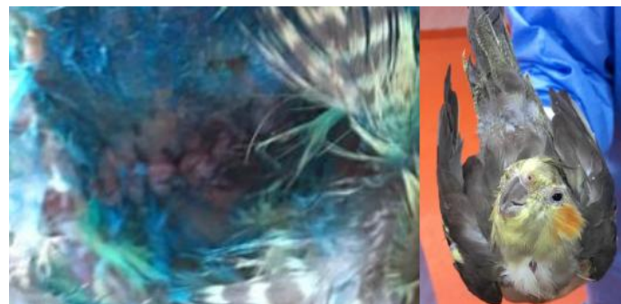
Figure 4: Postoperative appearance of abdominal region and Cockatiel.