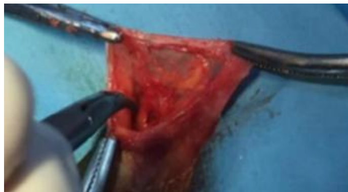
Figure 2: Appearance of intestines and mesentery in hernia sac.