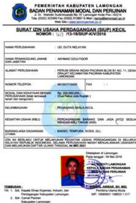
Gambar 7. Company's permit certificate (SIUP)