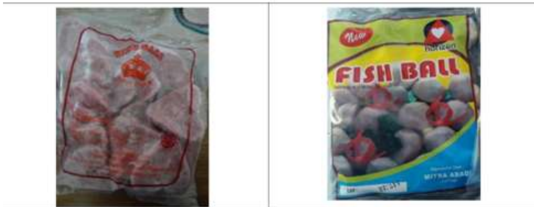
Figure 6. Fishball products of SME before and after certification