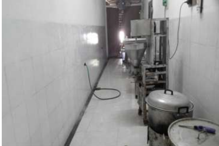
Figure 4. Production room

Most renovation materials were paid by Duta Nelayan, reflecting that a group of young entrepreneurs have good will to make their products be able to go to modern market. Other funds were obtained through collaboration program with Hang Tuah University, Directorate General of Higher Education-the Ministry of Research and Technology of Indonesia, and local Fisheries Services. Besides, the SME 'Duta Nelayan has prepared a hygienic meat grinder to support clean production process. The mixer has a capacity of 5 kg batter made of stainless steel.