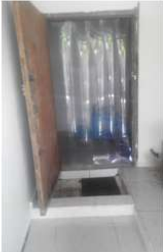
Figure 3. Production unit entrance

The layout renovation works included no toilet in the production room, preparing new toilet, dressing room, bio-security facility in front of the manufacture, ceramic wall and floor along the production room, drainage from the production room, separation of production room from the office. Several renovations are presented in Fig. 3 and 4.