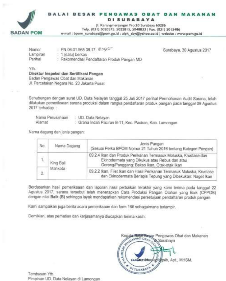
Figure 8. Circulation eligibility certificate-BPOM at phase 1