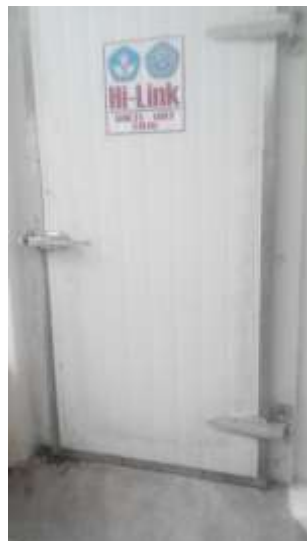
Figure 5. Mini coldstorage door

This layout renovation enables to promote the implementation of cold chain system in the processing from the raw material acceptance to the frozen storage. The raw materials came using ice cube cooling, and these were immediately processed with more ice cubes to maintain the fish temperature. The fish meat milling was also mixed with ice cubes, and to keep the evenness of the batter formulation, the ice cubes were weighed. After the products had been packed, these were in the ante room for 2 hours, then moved to the mini coldstorage of air blast freezer as shown in Fig. 5. The fishball products of Duta Nelayan are shown in Fig. 6.