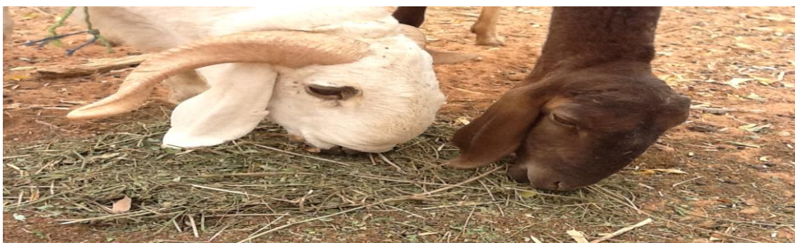
Fig. 1. Job opportunity; Sheep feeding on shade dried senna obtusifolia plants, harvested 84 days after planting.

maggi, (fig. 2), and matured seeds are packed in sacks for export (fig. 3). Traditionally and commercially, senna obtusifolia is not grown in Nigeria, both the leaves and seeds are presently harvested from the wild. There is limited research conducted on the effect of intra – rows spacing on growth, yield and biological characteristics of senna obtusifolia. In considering the above facts, there is the need to search for appropriate agronomic intra-row spacing for senna obtusifolia plant; to enhance livestock feed production, further research, profitability and economic diversification in tropical countries. .