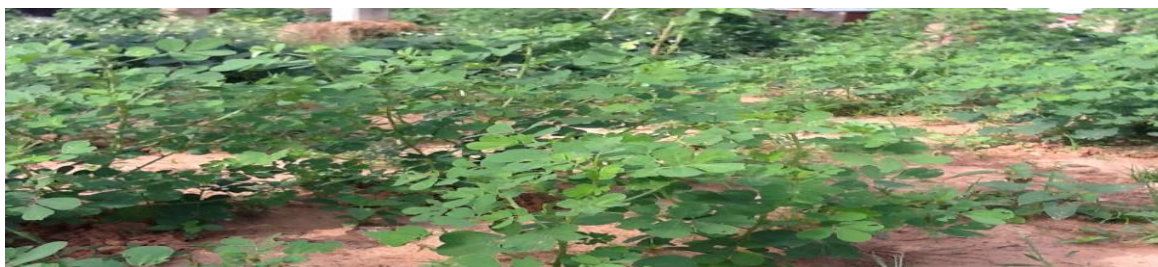
Fig. 5. Job opportunity; Phase (84 days after planting) to harvest senna obtusifolia plant for livestock feed (hay).