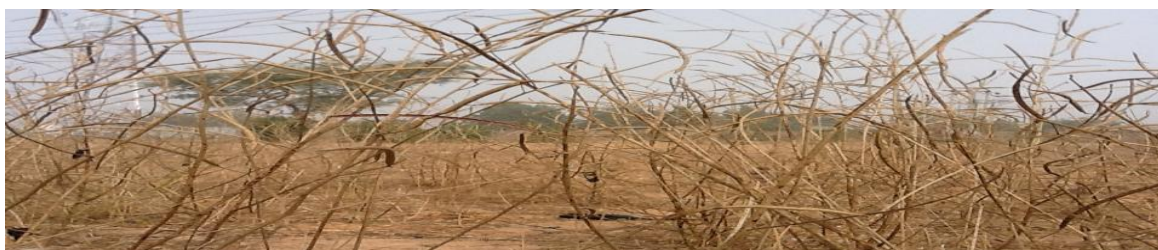
Fig. 6. Job opportunity; Senna obtusifolia economic plant at maturity. 158 days after planting to harvest seeds for export and raw materials for industries.