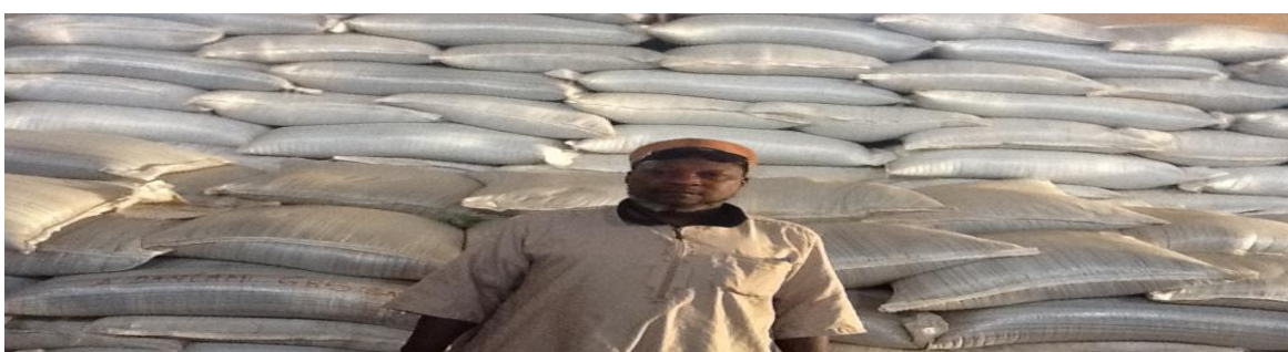
Fig. 3. Job opportunity; Senna obtusifolia seeds packed in sacks for export at Dawanau International market, Kano state, Nigeria. January 4, 2017.