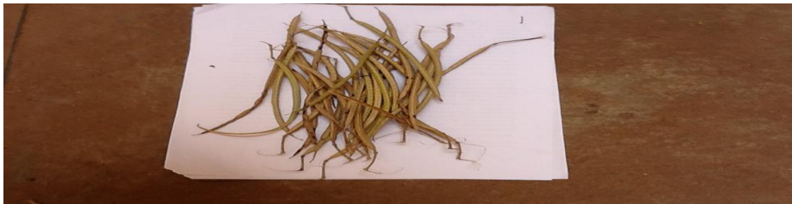
Fig. 7. Number of pods yield (32) of senna obtusifolia plant from narrow intra-row spacing of 10cm between plants.