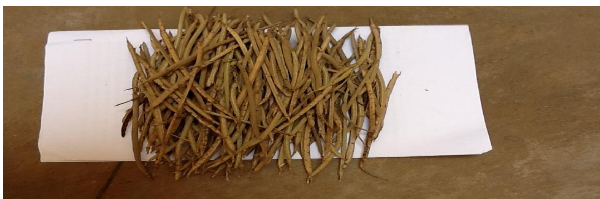
Fig. 9. Number of pods yield (221) of senna obtusifolia plant from wide intra-row spacing of 50cm between plants.