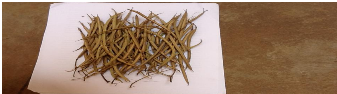
Fig. 8. Number of pods yield (65) of senna obtusifolia plant from medium intra-row spacing of 25cm between plants.