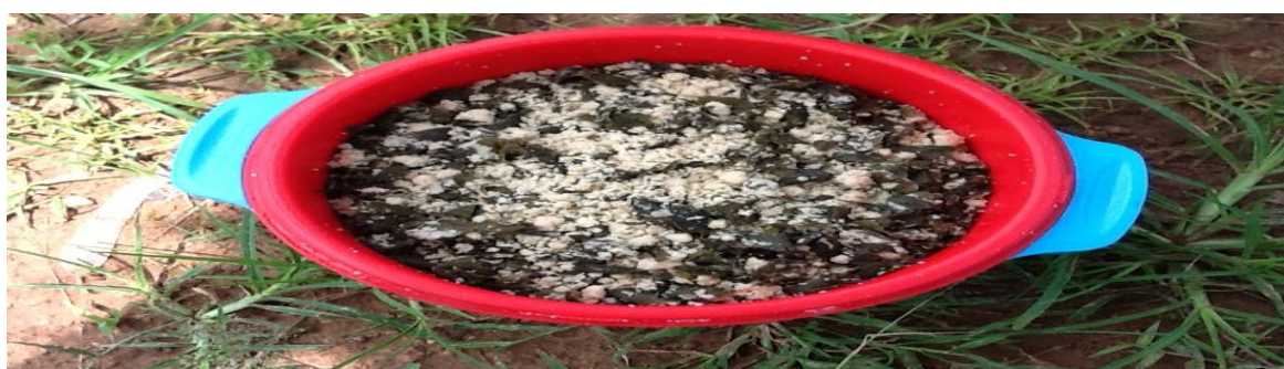
Fig. 2. Job opportunity; Senna obtusifolia delicacy (Danbu Tafasa food) inside plate; ingredients - senna obtusifolia leaves, maize grains (2mm), ground nut cake (2mm), palm oil, salt and maggi. Plant leaves harvested 40 days after planting.