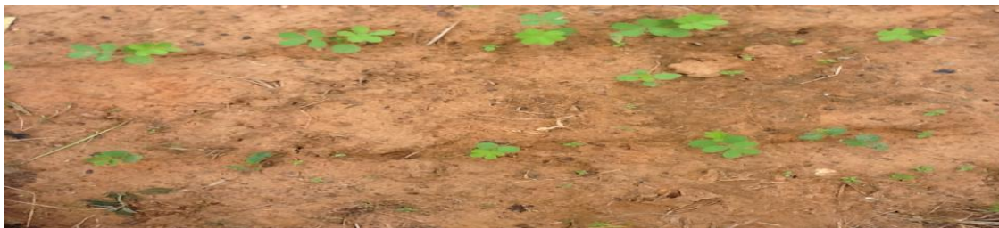
Fig. 4. Job opportunity; Phase (18 – 49 days after planting) to harvest senna obtusifolia leaves for human delicacy (Tafasa food).

Treatments consisted of three intra-rows spacing; narrow-row (10cm), medium-row (25cm) and wide-row (50cm) and constant inter-row spacing (50cm), the experiment was thoroughly monitored for over five months (figs. 4-9, table 1). Senna obtusifolia seeds were obtained in November, 2016 raining season from the premises of Federal College of Education (Technical) Bichi. The seeds were scarified in hot water for three minutes before planting (Abdulazeez, 2016). Four seeds were planted per hole and thinned to one stand per hole two weeks after sowing, seeds were planted by hand in 1cm deep furrows for all the treatments. There were four ridges for each treatment, a ridge was 300cm long and 50cm apart, all treatments (sub-plots) were replicated three times in a randomized complete block design (RCBD). Weeds were controlled by hand hoeing twice, first at three weeks after emergence with second weeding at four weeks after the first weeding. First manual fertilizer application (3g/plant) was four weeks after emergence with second application at four weeks after the first application as top dressing.