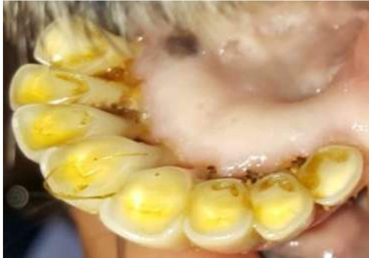
Figure 2: Dental wear