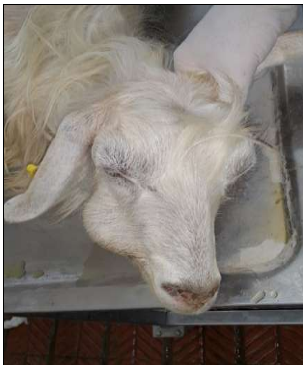
Figure 5: Molar tooth root abscess