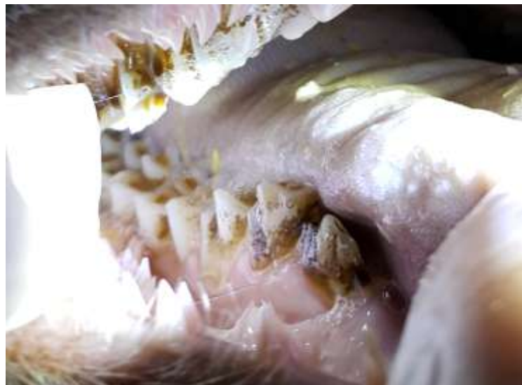
Figure 3: Gingival recession and peridontal pocketing.