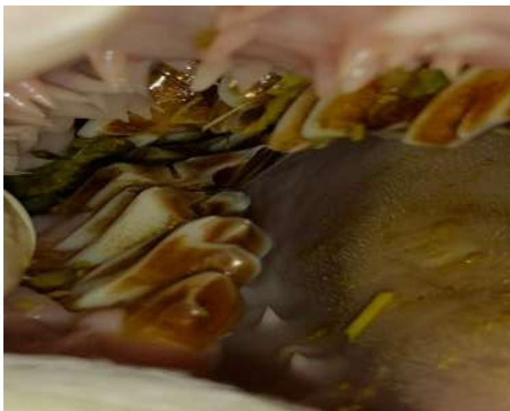
Figure 4: Excessive occlusal points and sharp edged teeth