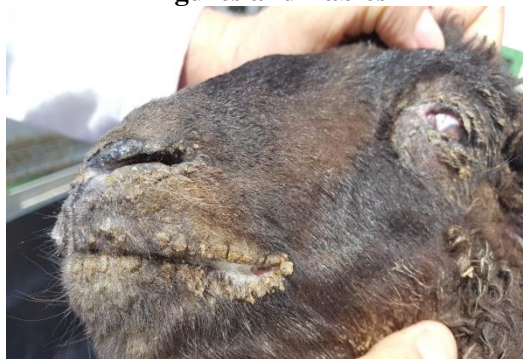
Fig. 1: Photograph of a sheep showing severe proliferative orf lesions on upper and lower lips