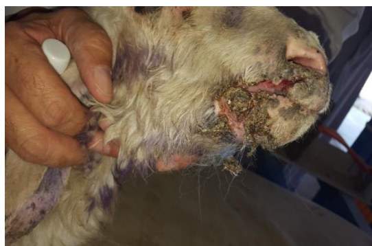
Fig 2: Photograph of a sheep showing proliferative orf lesions with thick, brown, scabs