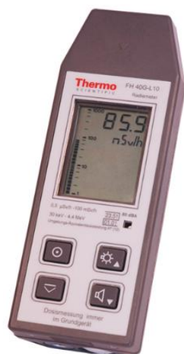
Fig. 2 FH 40 G-L10 Multi-Purpose Digital Survey Meter (9)

Background Radiation Measurement of SVU campuses was adopted using direct dosimetry. The FH40G-L10 alert Background radiation monitor adopted. The digital alert Background radiation monitor adopted (FH40GL10) is a health and safety instrument that measures gamma and X-ray radiation. The Model FH40GL10 is a stand-alone unit with an internal proportional detector and can simultaneously function with an external detector. Its measuring of dose rate range goes from 10 nSv/hr to 100 mSv/hr. The study area was subdivided into three locations. The academic block comprising of the College of medicine, science building 1 and 2, agriculture, art, education building 1 and 2, Archaeology, rights, Veterinary Medicine, Physical Education and quality education. The hostel block involving of A, B, C, D, E and L building, and some other public places inside the university like classes building hotel, theatre, bank and hospital.