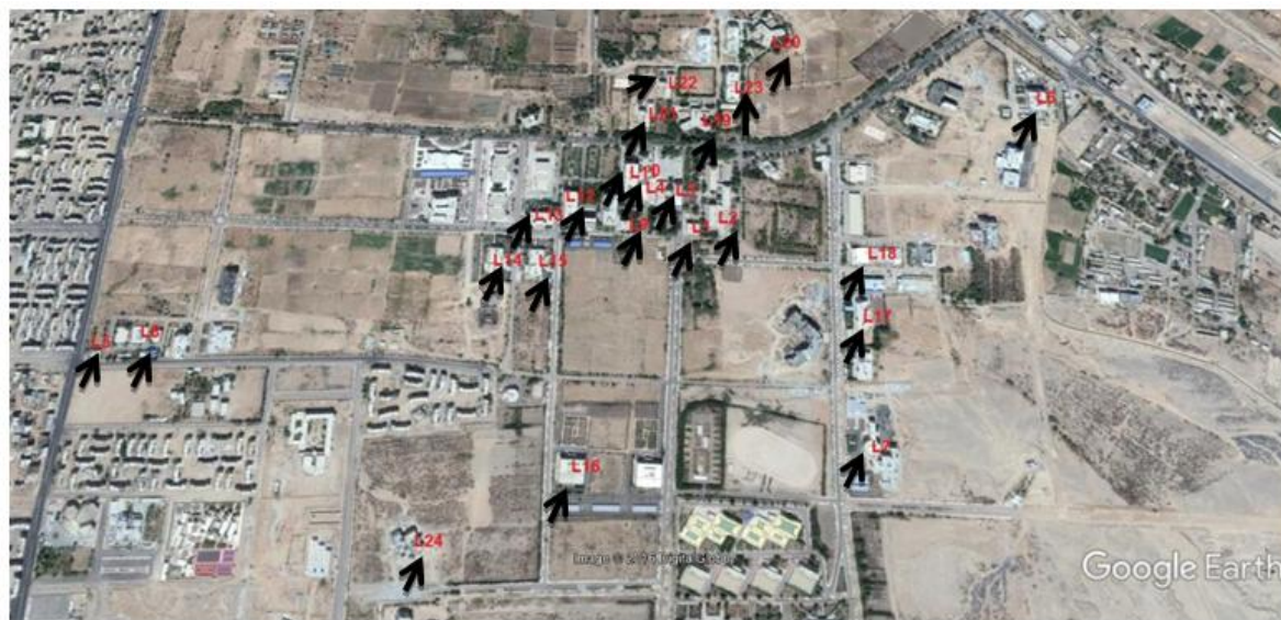
Fig. 1 Map of Study Area