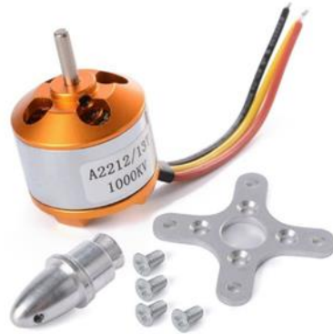
Figure 2: 1000KV Brushless motor