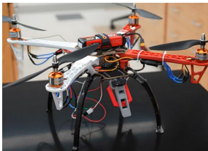
Figure 1: Quadcopter Drone with Claw Mechanism

Using a 3D print model of a claw attachment that our university's STEM facilities provided, we added a claw to our design while attempting to determine how to maintain the quadcopter stable for a continuous lift (Figure 1). After the print design was complete, we had to consider the best location for it to be placed without interfering with the drone's many specifications and circuits.