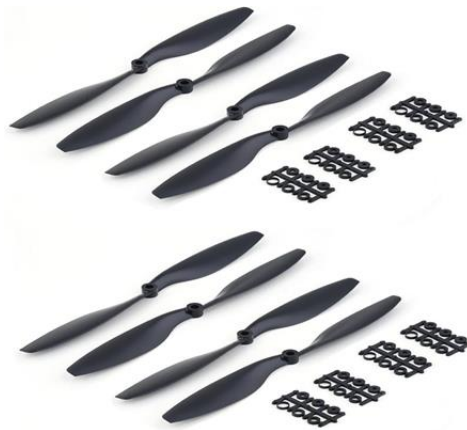
Figure 3: Propellers of Drone

While larger propellers can produce greater lifts but may require higher motor torque, higher voltage inputs result in increased thrust production and revolutions per minute (RPM).