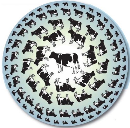
Fig4: The above is the famous cows figure used to explain effect of negative curvature. All the cows are having same shape (invariance) and proper size but due to negative curvature they appear smaller near boundary. This happened because of projection of 3 dimensional space on 2 dimensional paper. [7]

Second, AdS/CFT typically considers a supersymmetric gauge theory which has supersymmetry. In particular, the \mathcal{N} = 4 Super-Yang-Mills theory (SYM) provides the simplest example of AdS/CFT. Here, \mathcal{N} = 4 denotes the number of supersymmetry the theory has. The theory also has the scale invariance since the theory has no dimensionful parameter. Furthermore, the theory has a larger symmetry known as the conformal invariance which contains the Poincaré invariance and the scale invariance. Such a theory is in general known as a conformal field theory, or CFT. This is the reason why the duality is called AdS/CFT.