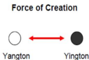
Fig. 1 Something - a Yangton and Yington pair with Force of Creation.

It is proposed that Yangton and Yington [2] are a pair of super fine Antimatter particles that can only be produced together with inter-attractive Force of Creation simultaneously from an empty space named as “Nothing”. This Yangton and Yington Pair with Force of Creation [2] known as “Something” can recombine and destroy each other so that Something can go back to Nothing. Both Yangton and Yington are the fundamental particles of the universe. They can be used to form Something (Fig. 1) and Wu’s Pair (Fig. 2) [2]. Something is only a temporary particle, but Wu’s Pair is a permanent particle which is the building block of all matter such as photons, quarks, electrons, positrons, neutrons, protons and Dark Matters, etc [3]. Instead of solid particles, Yangton and Yington can also be considered as two tiny Energy Whirlpools (Energy Particles) with opposite spin up (Yangton) and spin down (Yington) directions generated by the energy released from the Big Bang explosion.