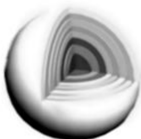
Fig.2. Shell Model of Atom

It is quite natural that along with such stable structures there are conventional harmonic density waves of even higher frequencies also appearing in the cosmic vacuum [18]. According to (9) it occurs under the V' \approx V'' conditions dominating throughout the space of the Universe. In the central gravitational fields of the nucleus such waves form spherical 'shells' around the nucleus. These shells are located at such a distance from the nucleus where the radial gravity forces \mathbf{g} are compensated by resulting repulsion forces caused due to the difference between gradients of density and forces at the 'slopes' of such shells. Since the density in such shells is maximum in their crests, the latter are located at distances from the nucleus multiple of the wavelength of their oscillation. In this case the shell in whole appears to be within the zone of libration, wherein gravity forces are balanced by repulsion forces. This is what ensures the stability of such structures. The number of the shells, their 'width', character of their oscillations, etc. may be different, which caused the variety of matters [19]. This is the way whereby the 'shell' structure of atom (see Fig.2) is formed. It consists of a central massive nucleus and a certain number of 'shells' which in quantum mechanics are called 'orbitals' and represented in the form of electron clouds.