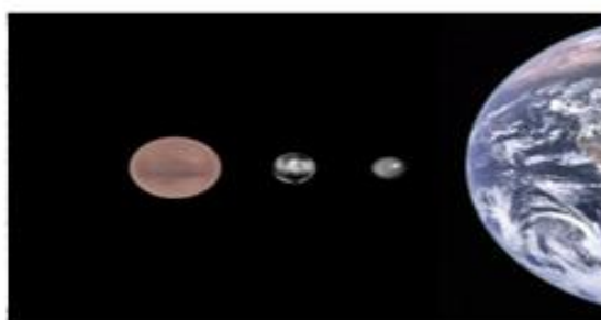
The candidates size-wise: Eris, Pluto, Ceres (and Earth)