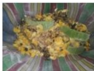
Figure- Flower and fruits of butea monosparma lutea