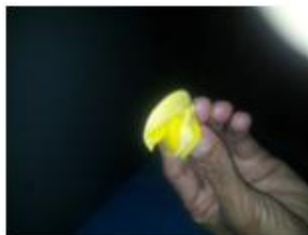
Figure- Flower of butea monosparma lutea.

then filtered thrice through Whatman No.1 filter paper to remove particulate matter and to get clear solutions which were then refrigerated(4°C) in 100 ml conical flasks for further experiments.