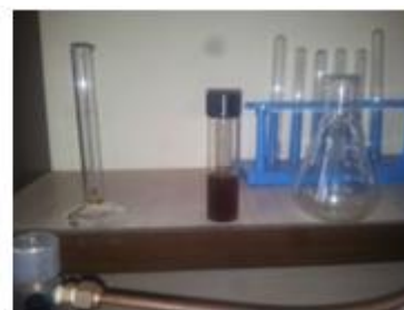
Figure- Characterization of silver nano particle

The production of silver nanoparticles by reduction of silver ions due to the addition of Butea monosperma lutea extract was followed by UV–Vis spectroscopy. The UV-Vis absorption spectrum of 'Green' silver nanoparticles in the presence of leaf extract is shown in .The band in silver nanoparticles solution was found to be close to 400 nm throughout the observation period as the nanoparticles were dispersed in the solution without possibility for aggregation in UV-Vis spectrum. The high OD of the solution suggests a high conversion of Ag + to Ag 0 as nanoparticle.